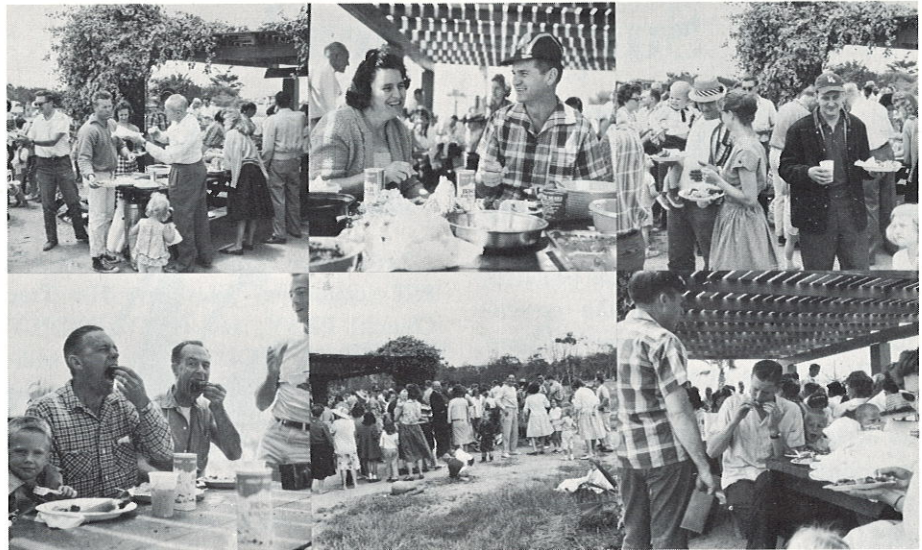
Pasadena B and C Clubs join forces with San Diego at San Clemente State Park.