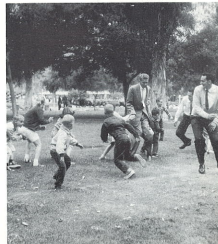
... and excitement for the children.