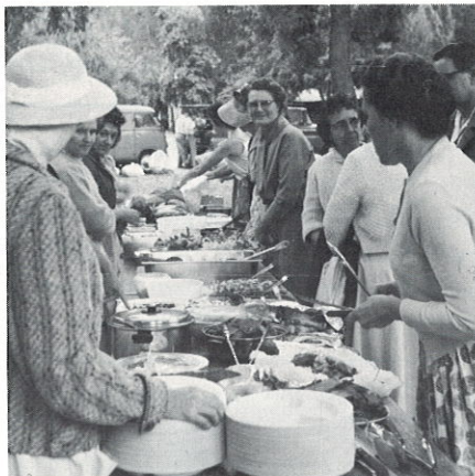
There will be plenty of food . . .

is having a proper amount of recreation, exercise and fellowship. This will all be provided in one major event. See the accompanying pictures to recapture the good time you had last year and come prepared for an even better time of real fellowship and recreation. So, come one, come all or else you will regret hearing about it through those who came and had such a good time. Yes, bring your mates who happen not to be in the Church. SEE YOU THERE!