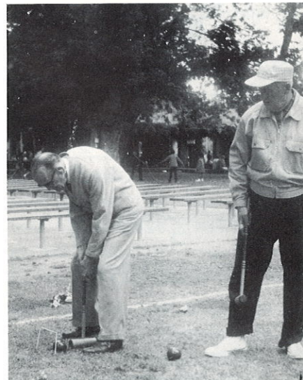
... fun for the adults

Mark the date on your calendar— THURSDAY, JULY 4. The time is 9 a.m. to 6 p.m. The place is Farnsworth Park which is located at the top